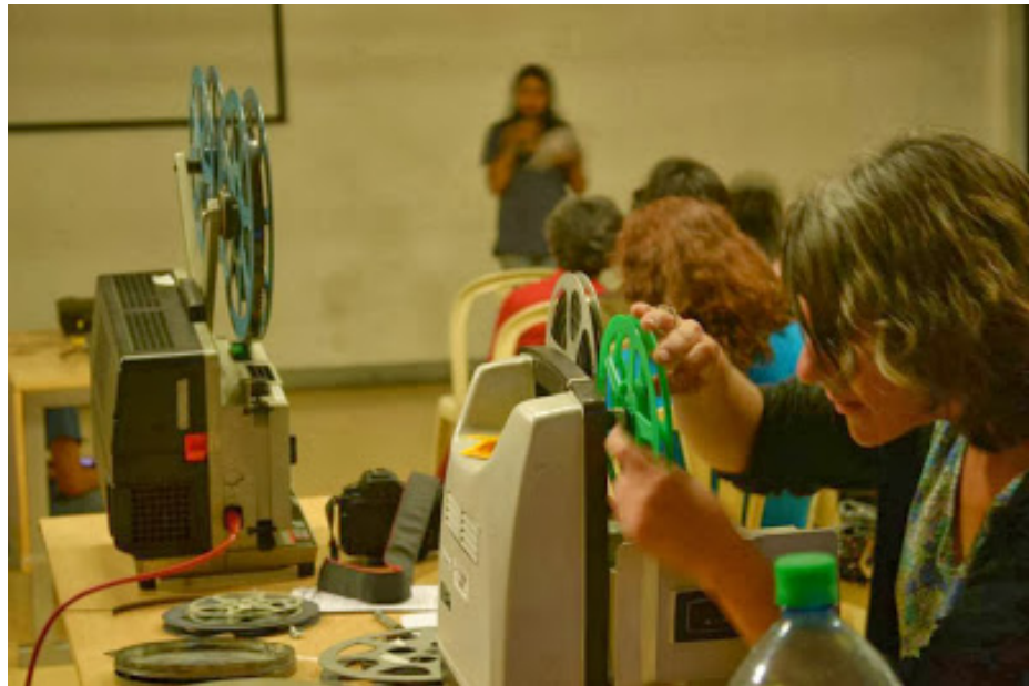
Threading up a home movie in La Paz, Bolivia.

spinning soul and 60s garage over films showing the destruction from a 1965 tornado and 1936 recital of avant-garde dance.