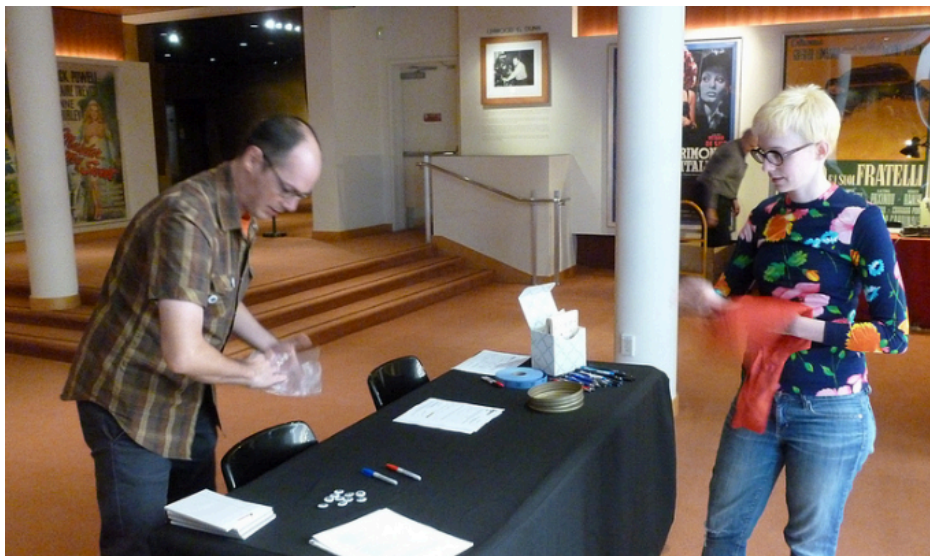
Volunteers setting up the check-in table at the HMD LA held at the Academy of Motion Picture Arts and Sciences.

clinic and screened 1920s footage of a northern Canada mining town, 1940s Jewish life in the Bellwoods neighborhood of Toronto, and Kodachrome slides of a flood.