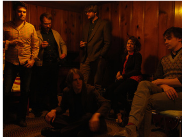
The Nashville band lylas.