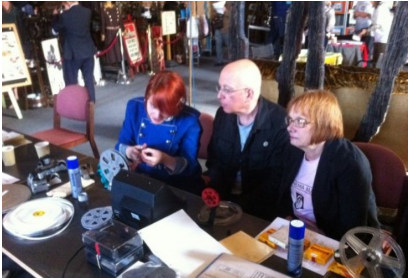
A volunteer at the London Home Movie Day held at the Cinema Museum London helps a couple with their family heritage

Every year the CHM mails out a small number of thank you letters to those who went above and beyond for Home Movie Day. This year four letters were sent.