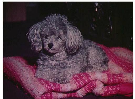
One of the Smith's many pets in Blanche's Recital .

https://archive.org/details/ArthurH.Smith-BlanchesRecital .